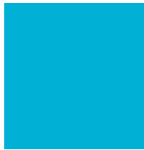
PANTONE 632 Blue