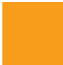
PANTONE 144 Orange