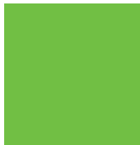
PANTONE 376 Green