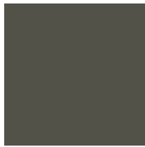
PANTONE Black 7c - Coated Papers